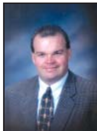
Judge Barth ND Wheat Commission