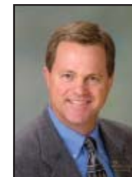
Dan Zink Red River Valley & Western Railroad