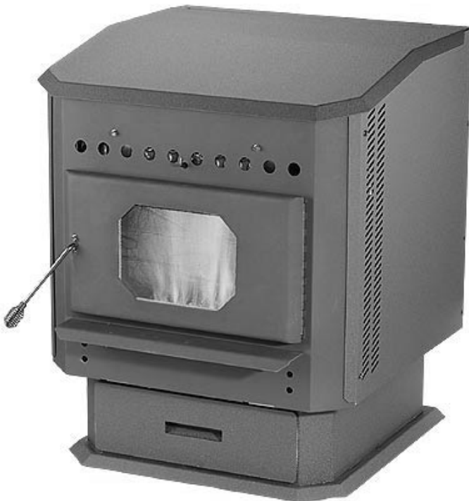
Figure 3. Example of a corn-burning stove