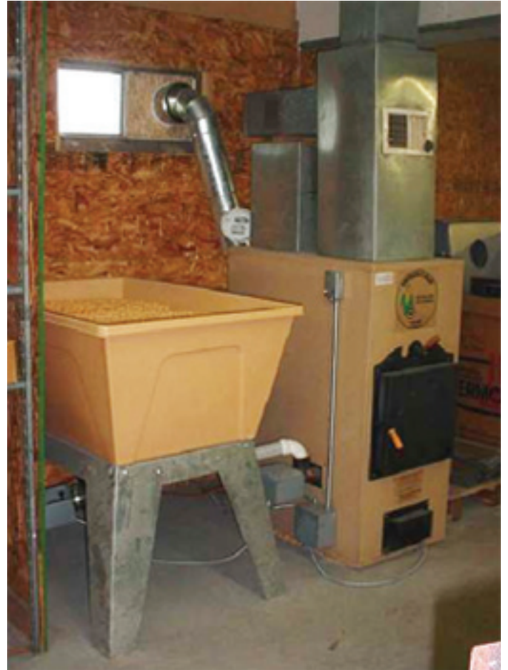
Figure 2. Example of a corn burning furnace