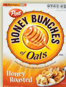
Honey Bunches of Oats (Honey Roasted only) Also: Our Family Oats and More with Honey, Essential Everyday Honey Oats and Flakes, Food Club Honey and Oats, Market Pantry Honey Oat Mixers and Malt O Meal Oat Blenders with Honey