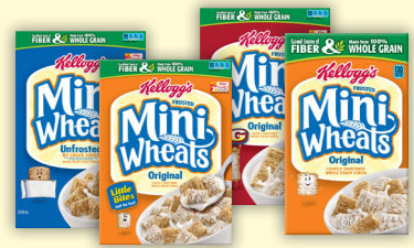
Original ▲ +, Big Bite + ▲, Unfrosted + ▲, and Little Bites Mini Wheats + ▲ (original only)