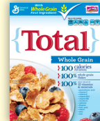
Total Whole Grain # ★ ▲ Also: Great Value Multi Grain Flakes/ HyTop Multi Grain Flakes