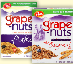
Grape-Nuts + ▲ & Grape-Nuts Flakes ▲