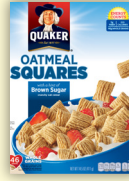
Oatmeal Squares ★ + ▲