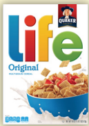
Life (original only) ▲ Also: Our Family 4 Corner Crunch, Shurfine OatWise, Essential Everyday Oat Squares