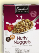
Essential Everyday Nutty Nuggets Also: Our Family/ Shurfine Nutty Nuggets, Food Club Wheat n Crunchy, Great Value Crunchy Nuggets