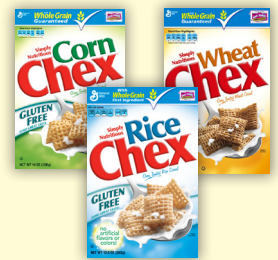
Corn ▲, Rice, Wheat ★ + ▲ Chex Also: Our Family Corn, Rice or Wheat Biscuits, Food Club/Essential Everyday Corn or Rice Squares, Great Value Toasted Rice, Corn or Wheat, Shurfine Crunchy Rice, Corn & Wheat Squares