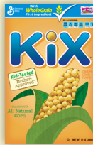
Kix ▲ (regular only)