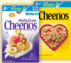
Cheerios ▲ & Multi-Grain Cheerios ▲