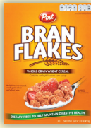
Bran Flakes + ▲ Also: Our Family, Food Club, HyTop, Great Value, Shurfine and Essential Everyday