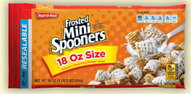
Frosted Mini Spooners ★ + ▲