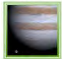
Space Sciences and Astronomy