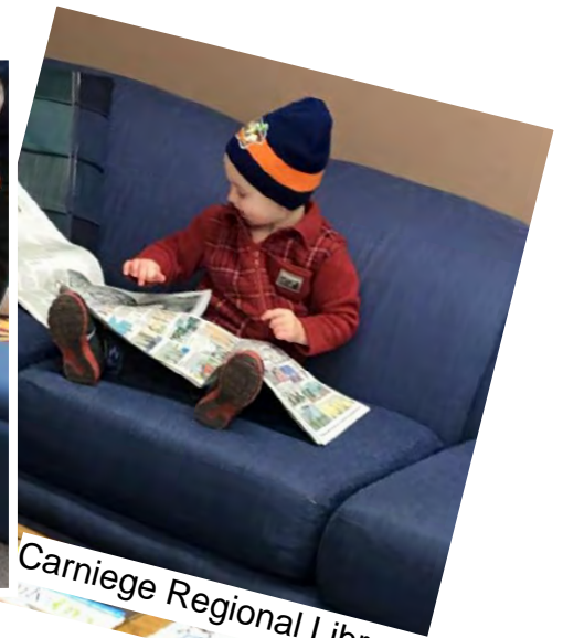
Carnegie Regional Library