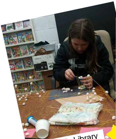
Mott Public Library