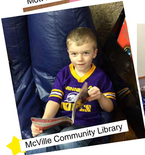
McVile Community Library