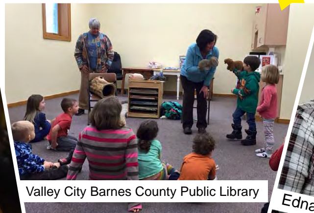
Valley City Barnes County Public Library