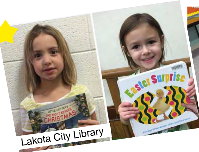
Lakota City Library