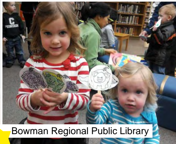
Bowman Regional Public Library