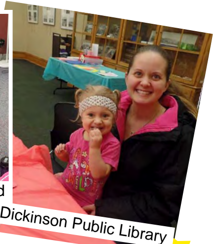
Dickinson Public Library