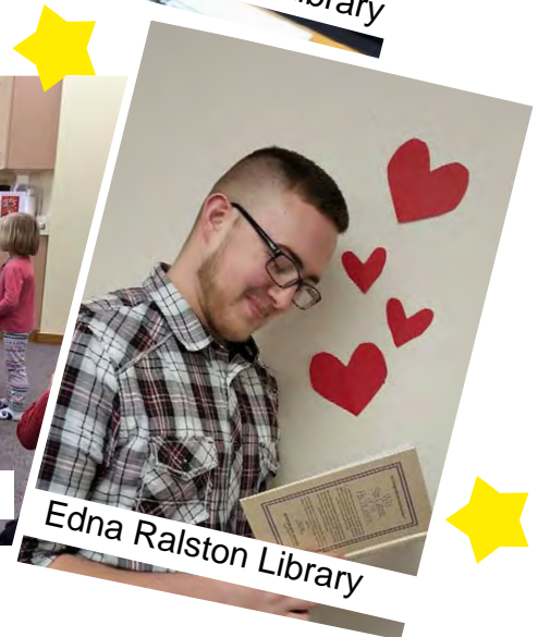
Edna Ralston Library