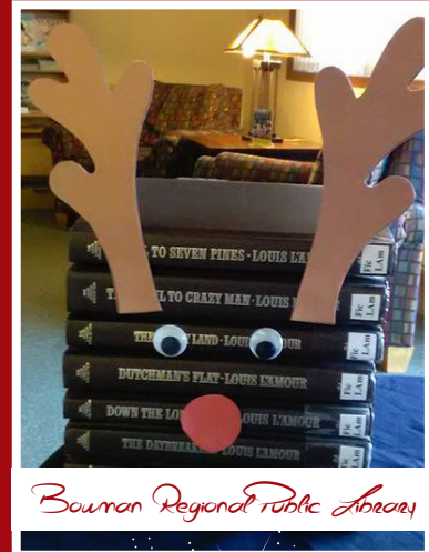
Bowman Regional Public Library