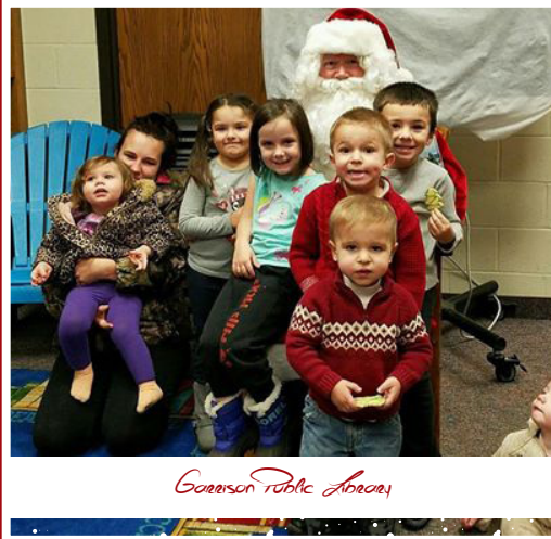
Groveson Public Library