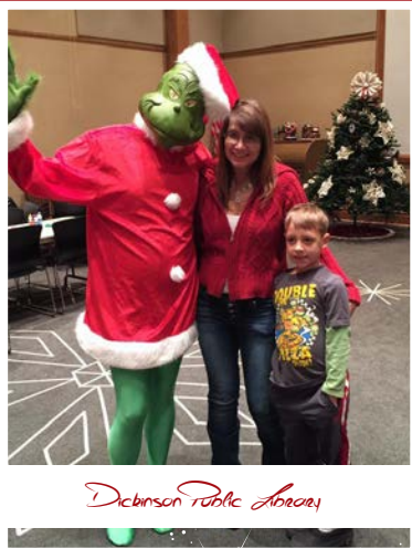
Dickinson Public Library