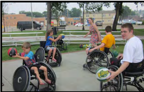
"Dreams in Motion" gave the kids an opportunity to play wheelchair basketball.

To learn more about getting involved in the SFSP in North Dakota, visit the Department of Public Instruction's Child Nutrition & Food Distribution website. We would love to see more North Dakota libraries participate!