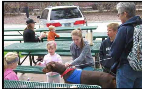
"READ" therapy pets who read with the kids for the Reading Tails Program.