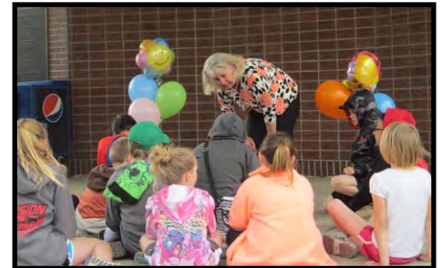
First Lady Betsy Dalrymple helped kick off of the program by reading to the kids and giving away books provided by United Way.