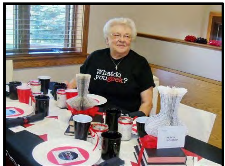
McVille Community Library's "Geek the Library" table for Hospice's Table Fantasia!

Britannica School is a 24/7 source for quality content created by educational experts. Designed for grades PreK-12, it contains encyclopedia and magazine articles, maps, images, and videos. Britannica School has a screen reader at all levels and citation tools. Content is updated daily and supports the new Common Core State Standards. Teachers also have access to educator tools and lesson plans. Britannica School can be accessed from school or home.