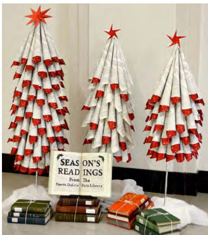
ND State Library