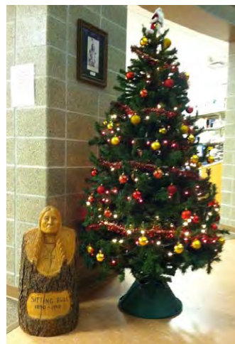
Sitting Bull College Library