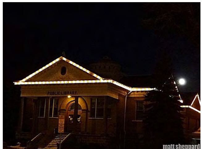
Valley City Barnes County Library