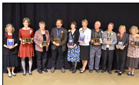
Award Winners at Tri-Conference Banquet