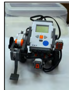
LEGO Robot, STEM Presentation

Tri-Conference is always fun because you get to meet new people and have a bigger selection of sessions to attend. This year I met a few North Dakota people that I'll be working with and talked with people from other states. I thought that the conference was very well organized. Some highlights were hearing about what it's like to serve on the Caldecott Award committee (they are sworn to secrecy as far as talking about which titles were in the running), hearing Rick Steves talk about how important travel is to have a broader view of the world and hearing about how one library staff improved customer service by first improving the staff morale by acknowledging when their staff did something well, encouraging their staff to have fun by dressing up on Talk Like a Pirate Day, etc. Next year NDLA is in Bismarck-Mandan, so I encourage you to attend.