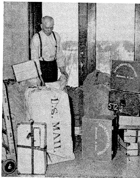
Shipping the traveling library circa 1950.

The North Dakota State Library marks its 90th anniversary in 1997. On January 21, 1997, the State Library will kick off a year long celebration by showcasing North Dakota State Library programs and services. At noon, Governor Schafer will be joining the celebration by reading to the second grade class of Grismrud Elementary School (Bismarck). Internet and ODIN demonstrations will be given. Join us in the celebrations from 12:00 to 2:00 at the Great Hall in the Capitol.