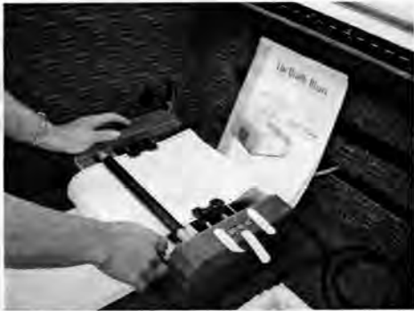
The Braille Blazer will make reading titles easier

Talking book patrons should notice a difference in some of the books they are now receiving because of a new Print/Braille label system being used by the North Dakota State Library Disability Services. The “Braille Blazer” has been in use since April, and is crucial in offering better service to all patrons.