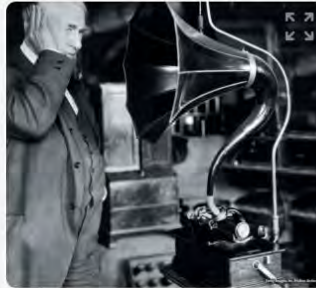
Thomas with a phonograph

▶ Thomas soon invented better telegraph machines. In 1876 he moved to Menlo Park, New Jersey. Thomas built a large laboratory . He asked other good scientists to work with him. In 1877 he invented the phonograph .